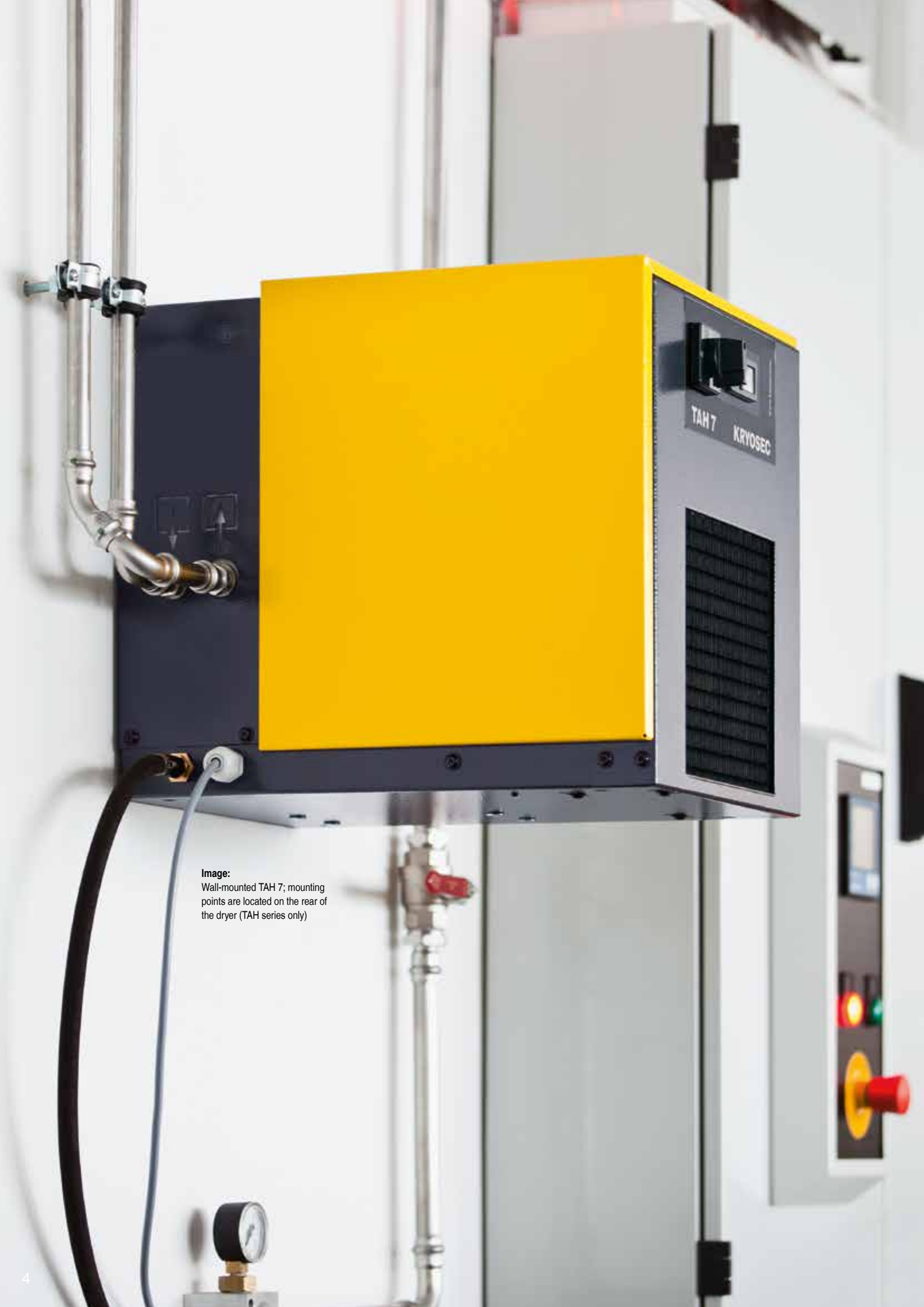
Image: Wall-mounted TAH 7; mounting points are located on the rear of the dryer (TAH series only)