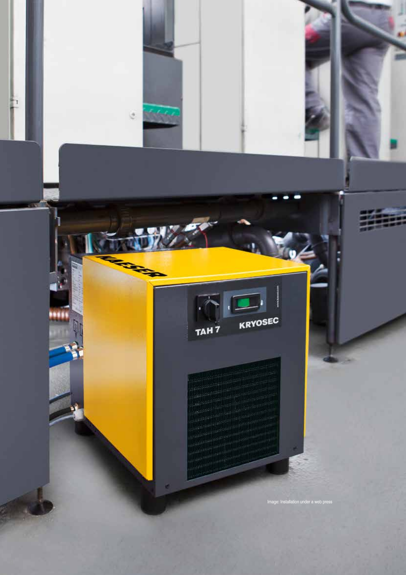
Image: Installation under a web press